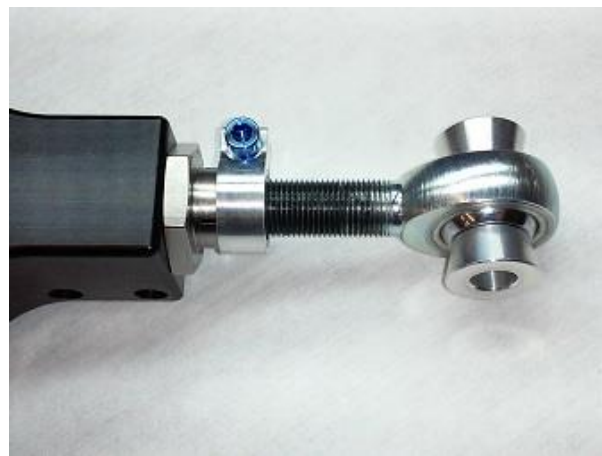
Overextended rod end.